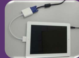
iPad / other apple devices

Ask LES to provide video adaptor, then select the source to be displayed.