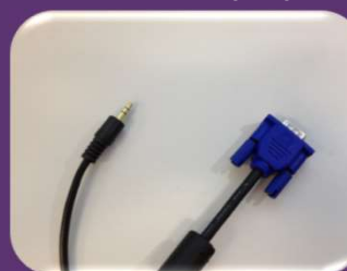
Connect video and/or audio cable to your laptop.