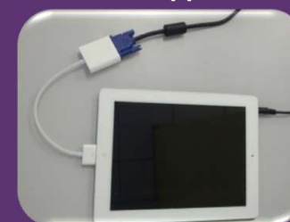
Ask LES to provide video adaptor, then select the source to be displayed.