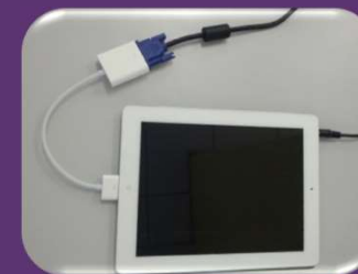
Ask LES to provide video adaptor, then select the source to be displayed.