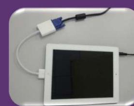
iPad / iOS Apple devices

Ask LES to provide video adaptor, then select the source to be displayed.